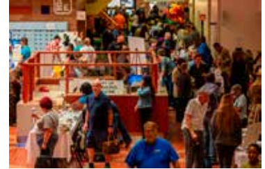
Retiree Appreciation Day at JBSA

More than 7,000 retired members and families attended the JBSA event, which is the largest conducted at any military installation worldwide this year.