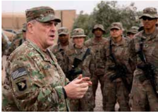
Chief of Staff of the Army Gen. Mark A. Milley speaks to Soldiers at Qayyarah Airfield West, Iraq, on Dec. 22, 2017. While there has been recent progress in readiness, Milley said that it still remains the Army's top priority.

Early reports have already shown a significant reduction in attrition and