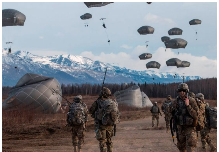
501st Parachute Infantry Regiment leaders observe as their follow-on paratroopers exit a U.S. Air Force C-17 Globemaster to join in the fight during a Joint Forcible Entry Operation exercise at Joint Base Elmendorf-Richardson, Alaska, May 3, 2017.

This article is general in nature and is not all-inclusive. There are also other restrictions that are not discussed in this article. Some of the above restrictions do not apply to enlisted service members. Always contact an ethics counselor in your servicing legal office for advice and information on the rules that pertain to seeking employment, and the post-Government employment restrictions. To locate the nearest legal office, use the MyArmyBenefits Resource Locator at http://myarmybenefits.us.army.mil/Home/Benefit_Library/Resource_Locator.html .