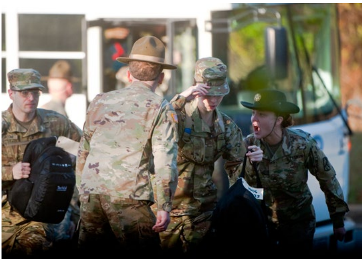
U.S. Army infantry Soldiers-in-training assigned to Alpha Company, 1st Battalion, 19th Infantry Regiment, 198th Infantry Brigade, are greeted by a Drill Sergeant on their first day of Infantry One Station Unit Training, Feb. 10, 2017, on Sand Hill. Some names may have been obscured for personnel security.