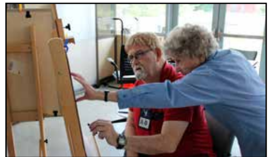
AFRH Services include recreational activities, resident day trips, a full-service library, barber shop, 24 / 7 security, beauty salon, computer center, mailboxes, banking services, campus PX/BX and off-campus shuttle and public transportation.

personal needs, attend a dining facility for meals, and keep all medical appointments. Fees for independent living are about 40 percent of total current income (not to exceed $1,425 / month).