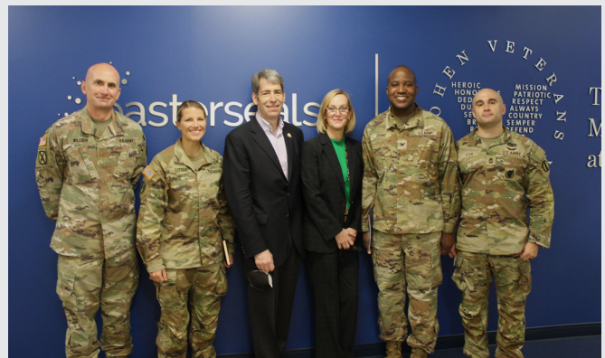
Team SFL had the opportunity to tour the Easterseals DC MD VA campus in Silver Spring, Maryland (September 2022).